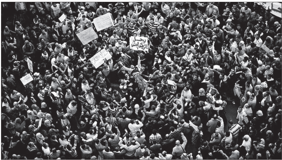
Crowds of protesters celebrate the presidents resignation