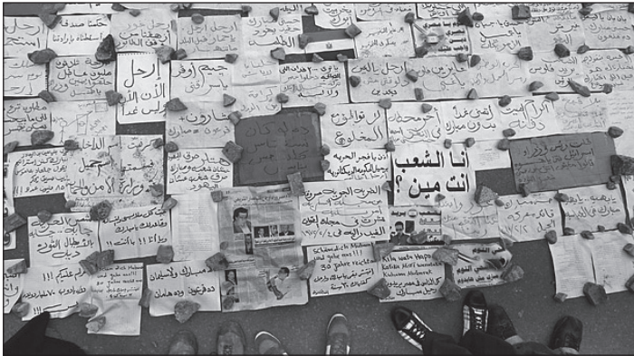
Protesters gather propaganda surrounding President Mubarak

The Egyptian military issued a communiqué pledging to carry out a variety of constitutional reforms in a statement notable for its commanding tone. The military's statement alluded to the delegation of power to