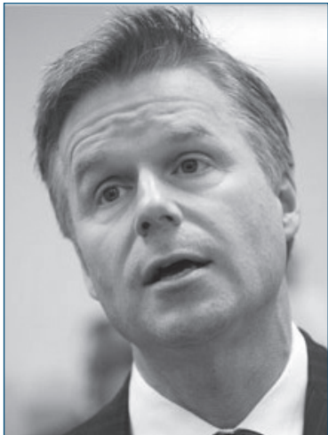
Congressman Christopher Lee

A married congressman from upstate New York resigned suddenly Wednesday after a scandal erupted over emails and a shirtless photo supposedly sent to a woman in response to a Craigslist dating ad.